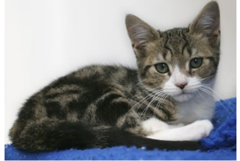
We promoted neutering at four months or younger

As well as passing on our knowledge, we also worked with selected researchers, including universities and PhD students. We shared our adoption centre data or allowed researchers to