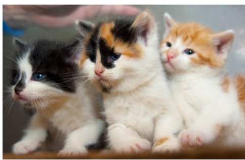
We found homes for Scrappy, Dusty and Rusty