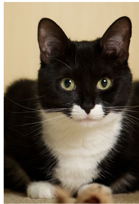
Our National Black Cat Day celebrated darker felines

As well as caring for cats today, we seek to help cats tomorrow by reducing the number of unwanted litters of kittens through our neutering programmes.